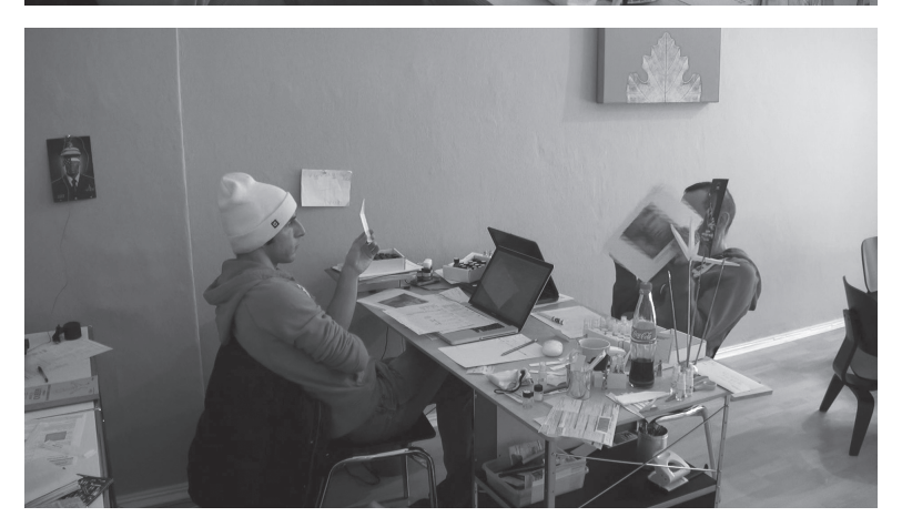
Figure 4.4 The visual concept in use by the perfumers