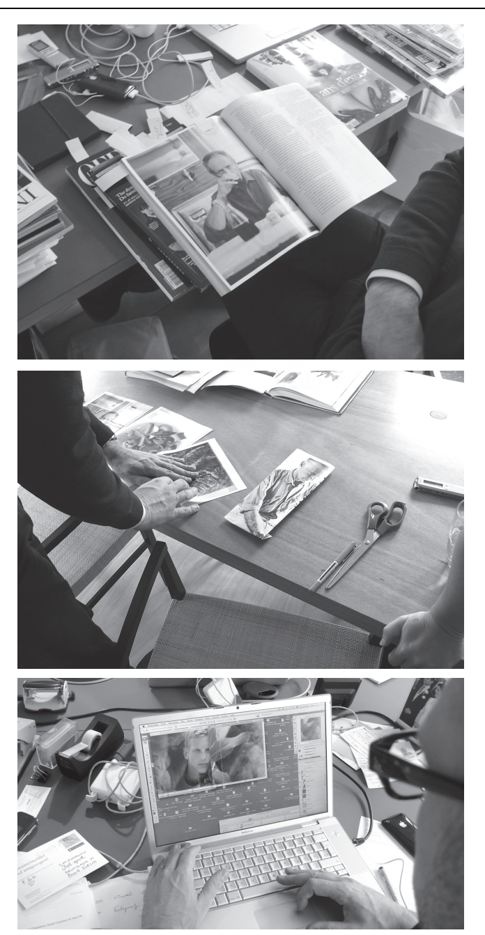
Figure 4.3 The making of the visual concept